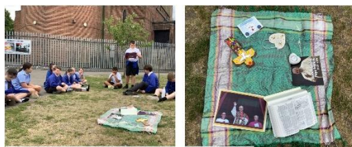
Celebrating the end of our Witnesses topic: Pentecost - the Holy Spirit enabling us to be witnesses to the Easter message.

Year 6 enjoyed a beautiful 'Rejoice' celebration in the outdoors this week, where they came together to share what it means to bear witness to the Easter message.